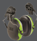
3M™ PELTOR™ X4 Ear Defender Helmet Mounted