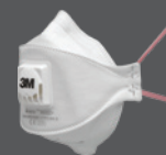
3M™ Aura™ 9332+ Valved Respirator